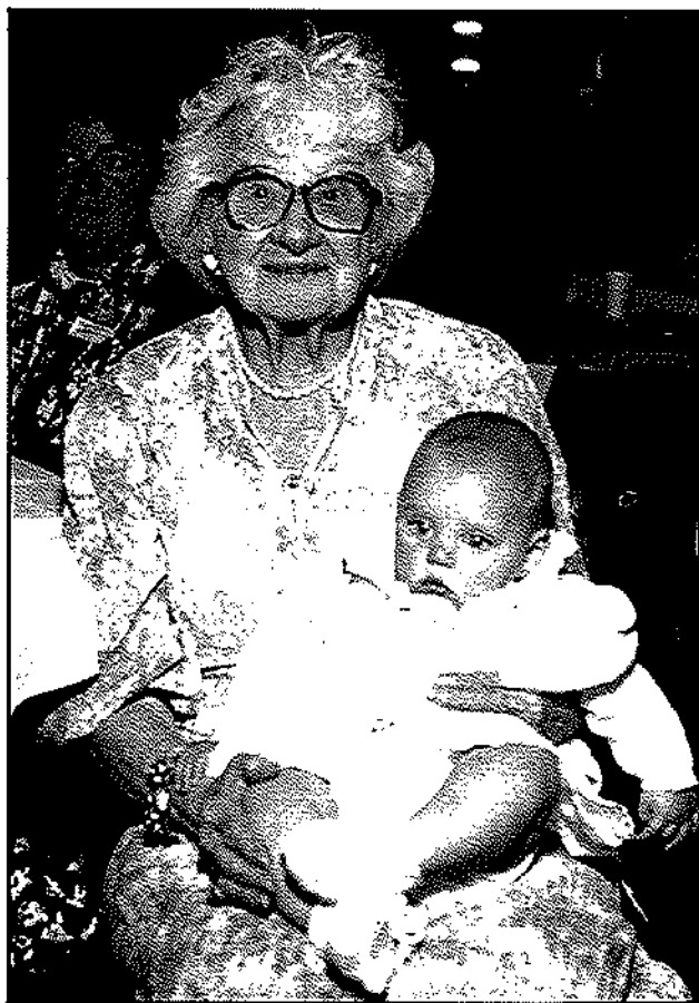
1989 Eldest and Youngest in Attendance