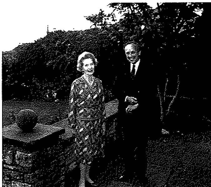
Two of our gracious hosts at Timsbury

Today we visit Biddestone, the village where our earliest Sanborn of record, Nicholas, was born circa 1320. He held the Biddestone lands from the Lady of the Manor of Castle Combe, a village we are also going to visit. She was the widow of Shakespeare's Falstaff (Sir John Falstaff). The village looks very different from the ones passed through in Hampshire and Somerset. Different stone, un-whitewashed walls and the use of dormers are typical. The village green has a stone cross and was a cattle-stop on the way to London. The church is another old, old one, redone over the centuries. On a column at the entrance is stone graffiti thought to be some kind of sun dial, dating from who-knows-when. One window has a glass medallion of the saxon Queen Matilda. Box pews are the first we've seen.