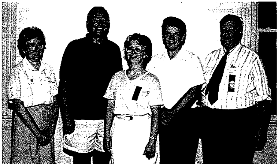
1994-1995 SFA OFFICERS